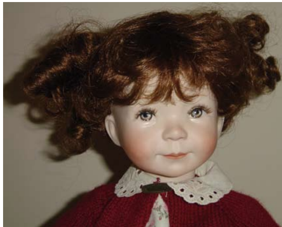
Jenny Porcelain, 2006 50 x 20 x 15cm

“When I was quite young I saw a magazine about creating porcelain dolls and from that moment I was hooked. Creating dolls is a hobby that I will never tire of. Originally I was motivated to recreate the look of an antique doll, but now I am fascinated by all facets of the hobby. There’s always something new to learn, be it the history of the original doll-makers, or new painting techniques to try and eventually (after much effort) master. Jenny is a modern doll created from a non-original design, while Silver and Arielle are reproductions of French antique dolls originally produced in France in the mid to late 1800’s.”