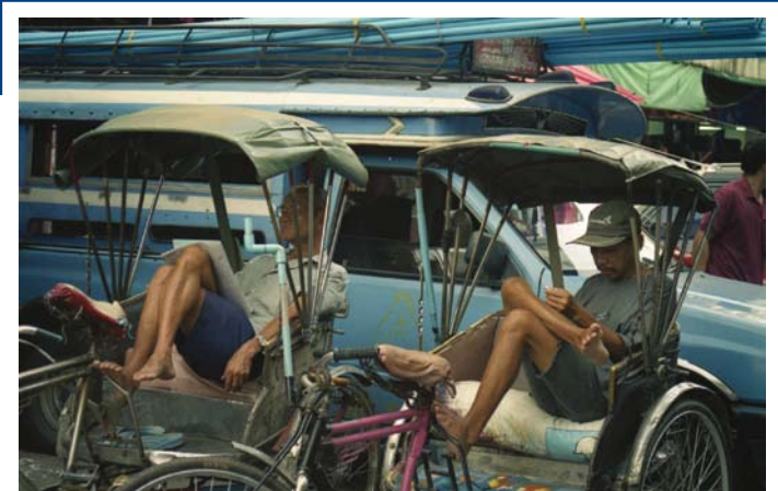
Time Out 2 Photograph, 2004 60 x 65.5cm

“I became interested in photography when I borrowed an old Olympus camera from my grandfather. Since then I have completed short courses in photography and in 2003 I brought my first Nikon 35mm analogue camera in New York. I am inspired and motivated by people, travel, and architecture. This picture was taken with the Nikon while travelling in Thailand in 2004. In the thick humidity of Chiang Mai, these rickshaw drivers take a moment out from work, oblivious to the humdrum of the city around them.”