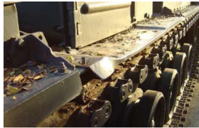
Ho Cho Minh Tank Photograph, 2006 20 x 30cm