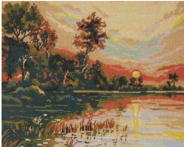
Soir D’Automne Tapestry, 2005 57 x 68cm

“My mother taught me needlework at a very early age and this carried through to my secondary education that covered a variety of arts and crafts. I have always had a love of arts and crafts as hobbies and in particular tapestries, although never creating my own designs. Each tapestry I work on is different and this one particularly interested me as it gives the impression of an oil painting in textile. The design was created by Royal Paris – France and is based on a painting by A. G. Rigolot titled Soir D’Automne . I am generally inspired by the design and the type of yarn it is worked with. I enjoyed working with the silky cotton and colours used in this tapestry and seeing the scene come to life as I worked. I enjoy applying what I have learnt and often pick up new techniques from the instructions provided with the tapestries.”