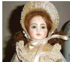
Above - Silver, Below - Arielle Both porcelain, 2006 20 x 10 x 10cm