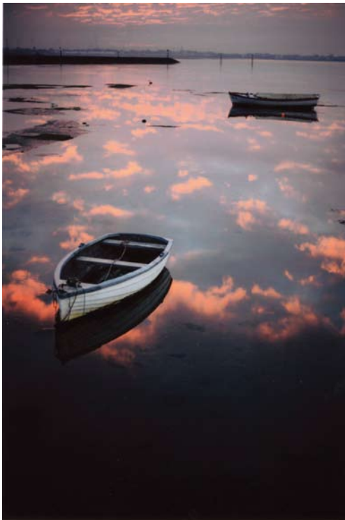
Boat Owners at Dawn Photograph, 2006 66 x 51cm

“I am mostly self-taught but more recently I have successfully completed the first semester of part time studies in photography. I am now exploring some of the more varied aspects of the craft such as colour and light, although I still have a strong interest in landscapes like those exhibited here. I hope one day to present a solo exhibition of my works. Boat Owners at Dawn : Are you asleep, are you dreaming? You float on water with your head in the clouds. You are still. It is silent. Nothing to disturb the boat owners at dawn.”