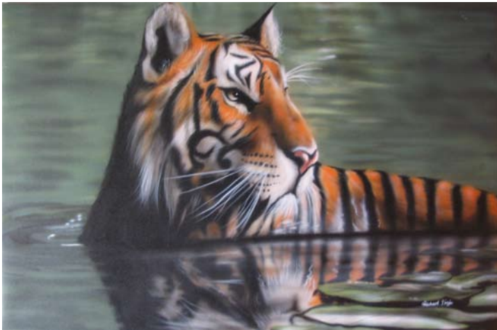
Tiger Enamel on canvas, 2003 73 x 115cm

“As a child I was fascinated by cartoons and comic books and felt compelled to draw and paint my favourite characters. This began a lifelong love affair with art that has become my passion. Over the years I have experimented with a variety of mediums, taking up airbrushing in 2000. Since then I have completed several large scale murals. I particularly enjoy portraiture and have painted many famous people from photographs. I also continue to explore pen and ink, creating characters for a graphic novel I would like to have published one day, but I continue to be interested in expanding my skills with all sorts of mediums and subjects. Tiger is an experiment in furthering my naturalistic airbrush techniques.”