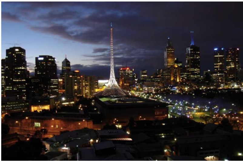
Melbourne CBD at Dusk Photograph, 2004 31 x 38.5cm

“I have always had an interest in photography, mainly for landscapes. I enjoy experimenting with the different camera settings to see what effects can be achieved and exploring various angles that can create a variety of images from the one scene. This image captures a balmy night in Melbourne from a St Kilda Road apartment block.”