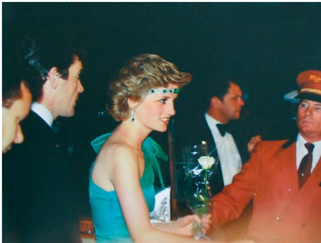
Welcome Princess Photograph 43 x 50cm

“I first started taking family shots and I loved being able to captivate a moment. I really enjoy the feeling when you develop the photos and find you have captured something wonderful. I was particularly lucky to get this shot of Princess Dianna several years ago when she attended the then Southern Cross Hotel. There were fans everywhere and I just happened to be in the right place at the right time when she stopped to accept a rose. I guess this photo has now taken on a different historical significance. I have recently turned to digital photography, which I thought I never would but I have found that I enjoy it even more and take a lot more photos!”