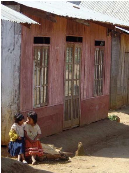
Friends in Lang Con Ca Photograph, 2006 30 x 20cm

“My month long trip to Vietnam in January 2006 was exciting, challenging, frustrating and still too short. I enjoy the challenge of trying to capture such an amazing trip in still photographs. Of course it can't really be achieved, but these three photographs capture the essence of Vietnam for me beautifully.”