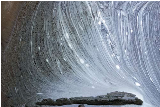
River Spean Photograph, 2006 38 x 47cm

“One of my first employers had a darkroom for their technical photos and this presented the opportunity to start understanding the techniques of photography – this teaming of optics and chemistry with the art of composition appealed to my scientific background. I enjoy the fact that photography demands that you look and see rather than just let scenes drift past. There is great satisfaction in capturing a special moment and presenting it in a way that can be enjoyed not just for the memory it brings but also for the intrinsic aesthetics of the image. In my photographs, I seek to capture patterns that exist in nature for a moment in time. Some, such as the light at dawn, frost on a flower, an approaching storm front or the swirl of river foam are fleeting moments. Others, such as the trees in a forest are perhaps less fleeting but they too are moments that will pass. Regardless of how quickly these moments come and go, they remain forever as images but there will never be a second chance to revisit that same pattern or, increasingly, to revisit even that same element of nature – we will have changed it.”