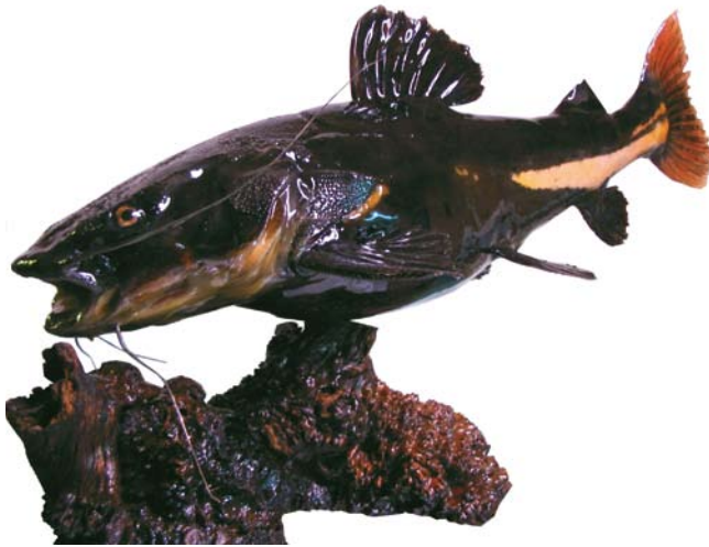
Red Tail Catfish 55 x 90 x 44cm

“I am devoted to my tropical fish and I raise them from babies and nurture and care for them over many years. Some of them live for up to ten years or more. When they die I am unable to part with them, so I have them preserved by a taxidermist. To me they are a work of art created by nature and my care and attention over the years, preserved now for maybe the next one hundred years.”