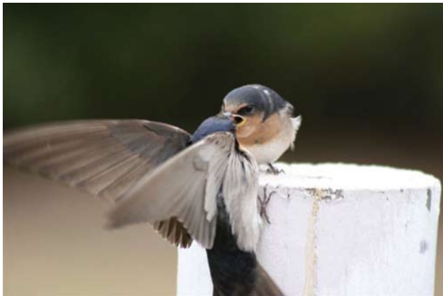
Feed Me Photograph, 2006 30 x 40cm

“I have been creative for as long as I remember. I enjoy painting, drawing, photography and a variety of textile based crafts including tapestry and cross-stitch. I also enjoy woodwork, making bookcases and simple furniture and my own frames for my artworks, also teaching myself to mount those projects as well. I think I inherited the creative gene from my parents, especially my mother who was always making something. Inspiration usually comes to me out of the blue - I would like to make art my life! This year beads seem to be the inspiration for my artwork. I got interested in beadwork when sewing beads on the wings of cross-stitch fairies. I have also recently spoilt myself by purchasing a high quality camera for my fiftieth birthday. I took a shot of this little bird, then thought I'll just take another to be sure I got it ok. At that very moment the mother flew in and fed him.”