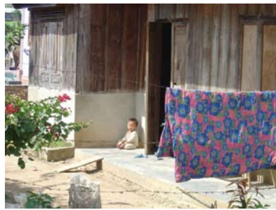
Lang Con Ca Child, Photograph, 2006, 20 x 30cm