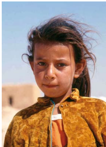
Beehive Bedouin Photograph, 2002 42 x 30cm